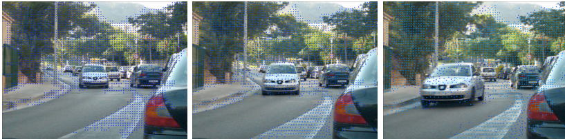
Fig. 1. Left: (a) Initial points in the first frame using a fixed subsampling grid. Middle: (b) Frame number 15 Right: (c) Frame number 30 of the cameramotion sequence. Figure best viewed in color.