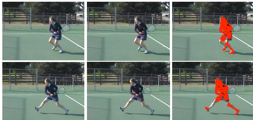
Fig. 4. (Top) Frame 490 of the tennis sequence with (left) actual image, (middle) KLT points and (right) LDOF points. (Bottom) Frame 495 of the sequence with (left) actual image, (middle) KLT points and (right) LDOF points. Only points on the player are marked. KLT tracker points are marked larger for easy visual detection. Figure best viewed in color.

speedup of 78\times over the serial version. This has been possible through algorithmic exploration for the numerical solvers and an efficient parallel implementation of the large displacement optical flow algorithm on highly parallel processors (GPUs). Moreover, we have proposed a dense point tracker based on this fast LDOF implementation. Our experiments quantitatively show for the first time that tracking with dense motion estimation techniques provides better accuracy than KLT feature point tracking by 46% on long sequences and better occlusion handling. We also achieve 66% better accuracy than the Particle Video tracker. Our point tracker based on LDOF improves the density by up to three orders of magnitude compared to KLT and handles large displacements well, thus making it practical for use in a wide variety of video applications such as activity recognition or summarization in sports videos which require improved tracking of fast moving objects like balls and limbs.